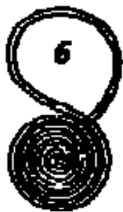
Spiral temple ring example from Peter Beatson article (see link above)

Reproductions of some types of temple rings are easily purchased from online vendors such as Birka Traders ( www.birkatraders.com ) or Armour and Castings ( www.armourandcastings.com ). Large Kutchi hoop earrings such as those found at Tribal Bazaar ( www.tribalbazaar.com ) can also be used to emulate some types of temple rings. The real challenge is finding the spiral temple rings that are documented.